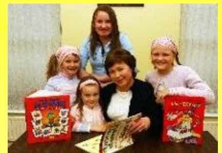
Migrant children reading for fun.

to remain a focal point within the Malachy's centre as their long established children's activity club provides a computer experience in a multicultural setting. Young people aged 8-14 years meet weekly to engage in learning through ICT. Here the computer experience operates through the medium of fun in an out of school setting. Assistance with homework is provided and a variety of projects have been undertaken including a children's DVD and photographic project of 'My Armagh' which was showcased by Armagh City and District Council in the launch of their Good Relations Programme 2010. Drama and creative arts and crafts have also been showcased within the Malachy's centre which draws families into a multicultural setting therefore promoting good relations across the community divide.