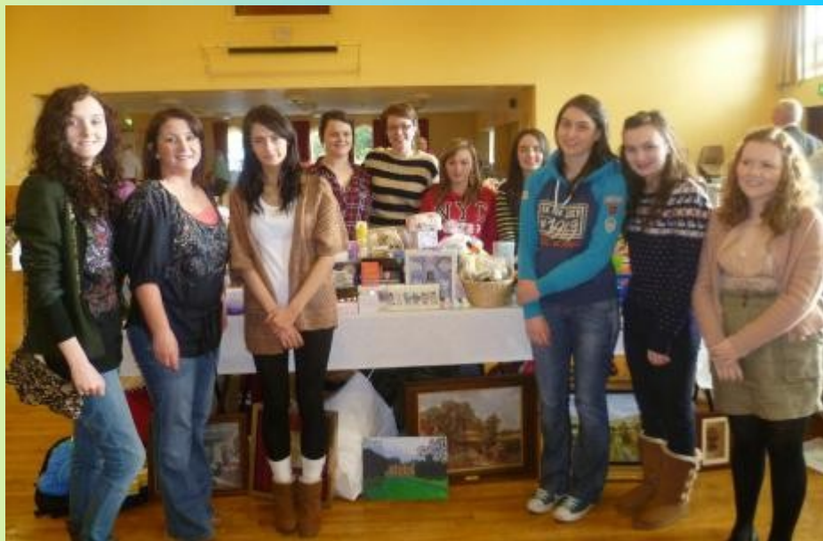
Year 13 Loreto Grammar School SVP group with their teenage stall

Our school group also took part in the SVP Annual Sale of Work on the 5 th November in St Joseph's Hall. We were in charge of a teenage stall on the day, so in preparation we were assigned year groups and we spoke at assemblies and went around Form